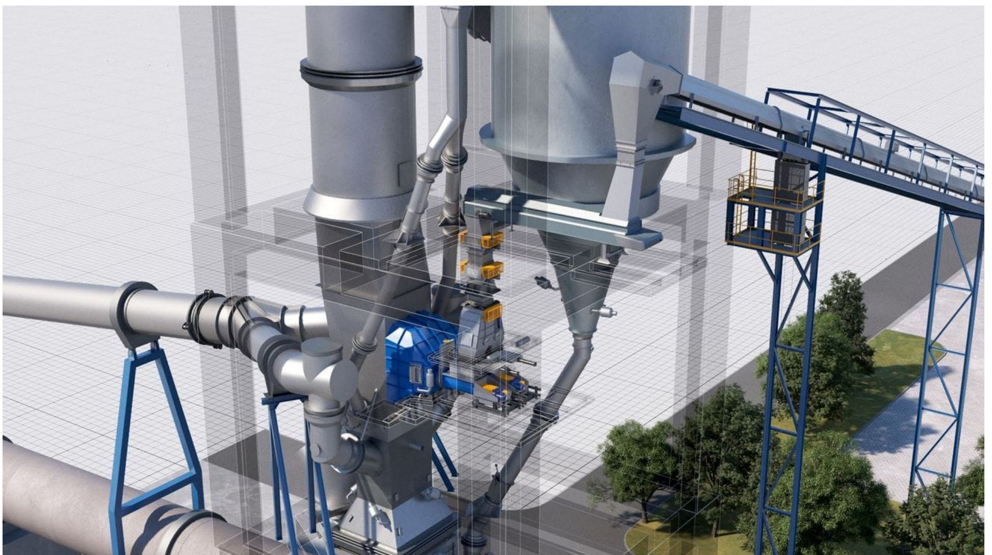
prepol® SC technology

In addition, the latest generation of the polytrack® clinker cooler will be integrated into the new kiln line. This will be installed in the existing cooler housing.