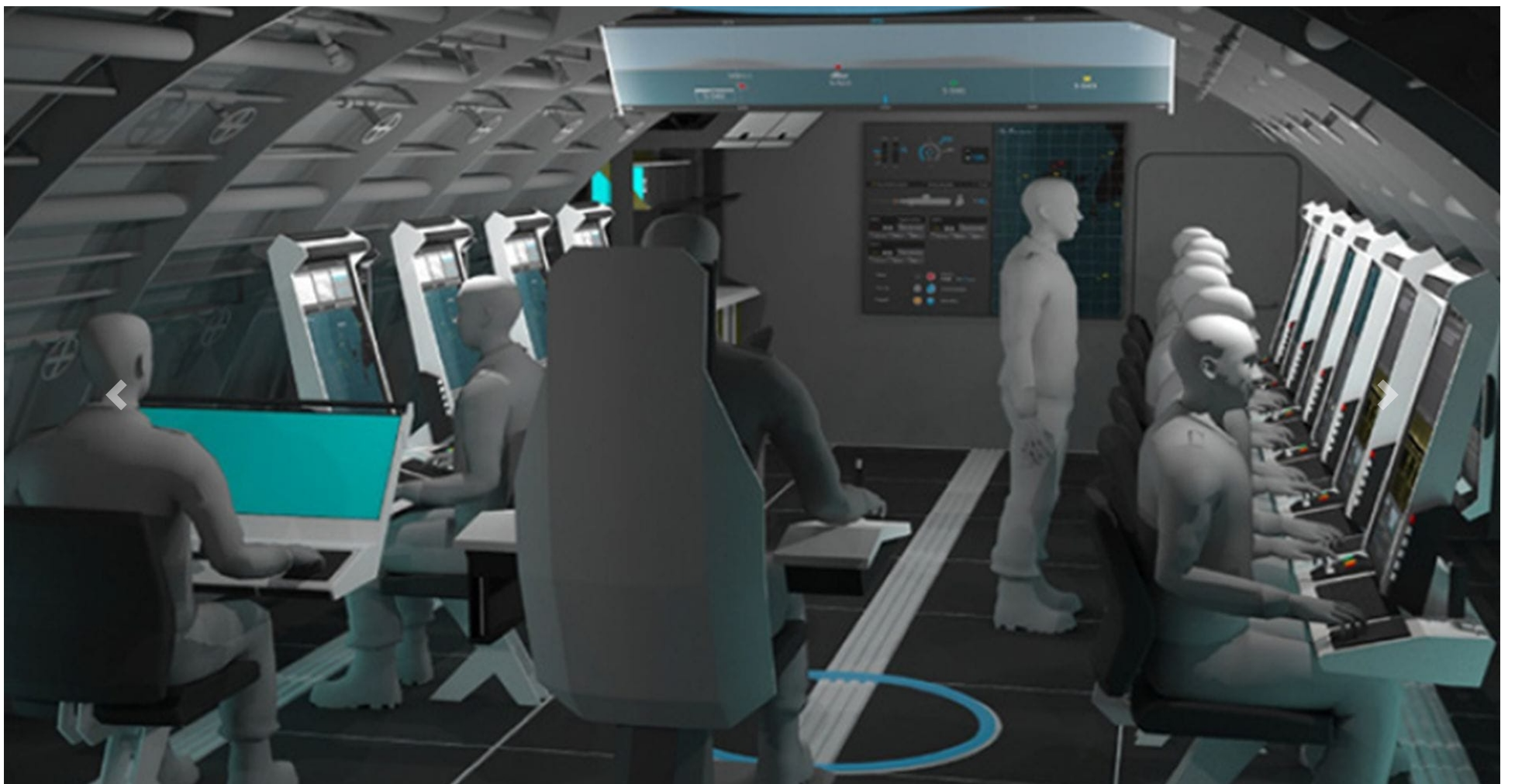
A possible layout for future operations centers in the new submarines designed by the Norwegian research institute FFI. Illustration: HALOGEN

The bottom line: The commissioning, or setting to work, of the delivery portion of the Polysius business unit will be carried out in time for delivery of the first boat in 2029.